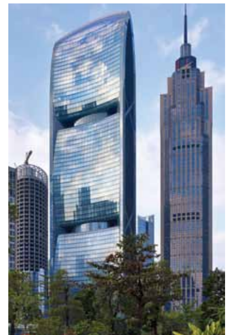
Figure 3: Climatic elements are not only something to be mitigated in tall building design, but can become embraced for positive effect in both the form and operation of tall buildings; natural energy capture, natural ventilation, rainwater capture etc. The strategies and systems to enable this can influence the design and expression of the building. Pearl River Tower, Guangzhou (2013) demonstrates several of these ideas.

In the case of rain, many sustainability rating systems such as LEED now award points for rainwater capture and recycling but, in the case of most tall buildings, the area of capture is usually only a part of the tower roof or podium roof. In the context of skyscraper