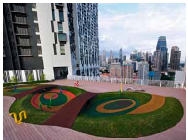
Figure 10: It is nonsensical that we are going ever more vertical in our cities, without introducing the horizontal. Skybridges and Skyplanes give the opportunity for not only linking functions, circulation, services and fire evacuation routes across tall buildings, they can create significant urban habitat in the sky, as evidenced by Singapore's 2009 Pinnacle @ Duxton housing project.