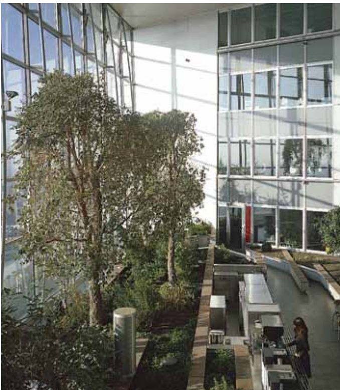
Figure 7: The 1997 Commerzbank in Frankfurt is still one of the best examples of significant, communal skygardens in a tall building anywhere in the world. This office building is also potentially an excellent model for an idealized residential building, with thin, cross-ventilated floors of apartments all grouped around one of ten “gardens in the sky,” where a sense of residential community can develop.

resources between towers (spatial as well as service infrastructure), improve evacuation options, and reduce energy consumption through allowing horizontal as well as vertical movement between towers. There has hardly been a science-fiction city of the future created in the past 100 years that hasn't embraced the idea of the multi-level city, because it seems implausible to people creating those future cities that we would reach to hundreds of stories and yet require every inhabitant to descend to the ground plane to move sideways, breathe fresh air, or get lunch. In Hong Kong and many other cities in China, we often see numerous identical residential towers side by side in long rows – five, six, seven towers – often separated by just a few meters, but with vacant fire refuge floors all lined up at the same level. What leap of imagination would it take to physically connect these vacant refuge floors with skybridges, simultaneously giving more fire evacuation routes but, perhaps more importantly, creating the potential for communal zones in the sky? 8 Fortunately, many building designers and owners are now recognizing this, 9 with projects such as