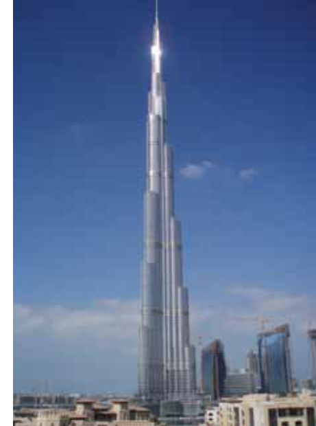
Figure 5: Both climate and the visual relationships in a city vary massively with height (top). The great heights being achieved with some tall buildings today effectively mean a single building is being designed across numerous climate zones. For example the Burj Khalifa (bottom) is approximately 6–8 degrees Centigrade cooler at the top of the building than the bottom. This should be used to influence the form, skin and program of the building. Tall Buildings should be designed in height "horizons," taking advantage of the unique opportunities of each horizon.

throughout the building, depending on the responsibilities of each different horizon within the form. The MEP and other systems would also vary (at the very least air intake should occur at the top of the tower, to take advantage of several degrees of free cooling). The concept of scale should thus be introduced throughout the building – a tall building could be thought of (and designed accordingly) as a number of small buildings placed on top of each other within an overarching framework of structure, systems, aesthetics, etc., rather than one extruded, monolithic form inspired by a single plan.