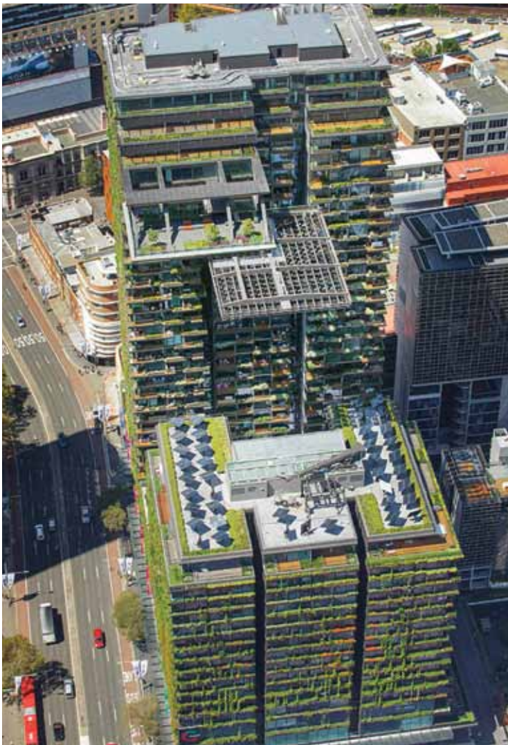
Figure 9: The benefits of introducing more greenery into our cities are well documented, plus green walls made up of local plant species would help create both a localized vernacular for tall buildings, and an aesthetic more akin to the environmental challenges of the age. The 2014 One Central Park in Sydney shows what is now becoming possible with greenery in the skin of high-rise buildings.

Singapore's 2009 Pinnacle @ Duxton housing scheme connecting seven residential towers with not only skybridges, but skyparks at two horizons in height, containing gardens, jogging tracks and significant urban habitat at height (see Figure 10).