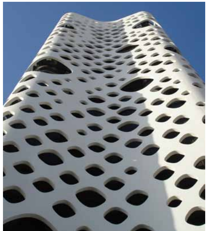
Figure 8: It is nonsensical that we are building towers with all-glass façades, especially in intense solar environments such as the Middle Eastern deserts, then expending more energy installing solar shading to cover up the glass. Tall buildings should concentrate glazing where it is best placed, and introduce more opacity back into the façade, which would also give a greater opportunity for more varied expression, as seen in the 2009 O14 Building in Dubai.