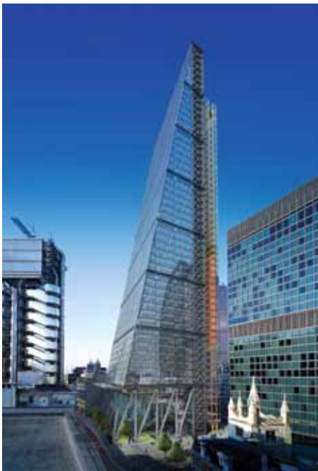
Figure 2. Tall Buildings should respect the existing built legacy, and relate to it where possible. The sloping form of the 122 Leadenhall Building London (2014) came about as a response to not blocking views to/from both St Paul's Cathedral and the St Andrew Undershaft church to the east of the site.