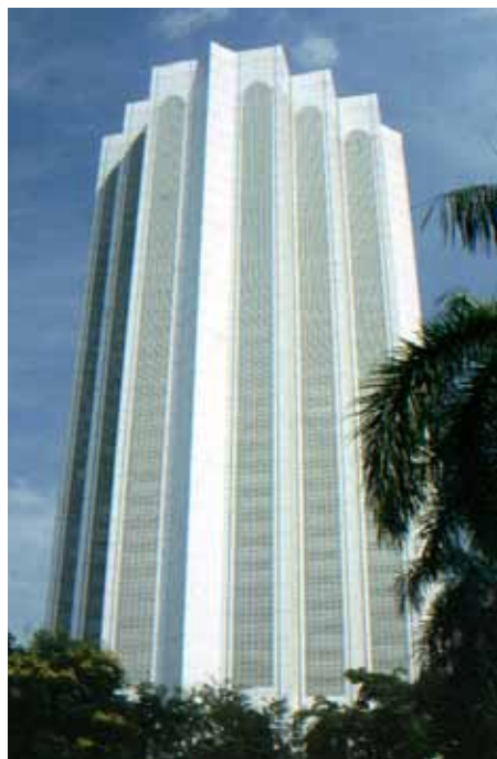
Figure 4: Tall Buildings can reflect the local culture in a literal way – as demonstrated here with the 1984 Dayabumi Complex in Kuala Lumpur with its façade a modern interpretation of the Islamic jali screen – or in a more direct way, by incorporating specific activities and ways of life into the program of the building.

Whereas the physical and environmental aspects of place are more easy to define, the cultural aspects of place are less tangible. Culture is more connected with the patterns of life in a city, and how this manifests itself in the customs, activities and expressions of the people. Culture can thus be embraced in a literal way in the building, as demonstrated by the 1984 Dayabumi Complex in Kuala Lumpur (see Figure 4), with its Islamic outer façade skin an interpretation of the vernacular Jali screen (though this also has the significant added benefit of shielding the curtain wall behind from direct solar gain). Or it can happen by embracing an aspect of the culture directly into the building program. In 2010, for example, a student scheme we developed in Mumbai (Wood, 2010) was placed on the site of an existing dhobi ghat; the huge outdoor washing areas in Mumbai that account for