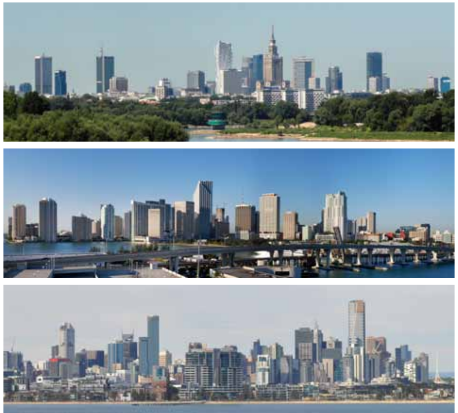
Figure 1. Cities of the world are becoming culturally and aesthetically homogenized, with skylines that become synonymous with the place, but are not necessarily related to the culture or climate. Skylines from top: Warsaw, Miami, Melbourne.

This paper thus outlines 10 design principles which the author believes would result in tall buildings much more related to their locations; a local-specific approach to skyscrapers, as opposed to the adoption of a global template. It uses built examples to illustrate the points made and, in some cases, some of the work developed by the author as an architectural professor at various institutes, working together with students. The 10 design principles are not intended to be