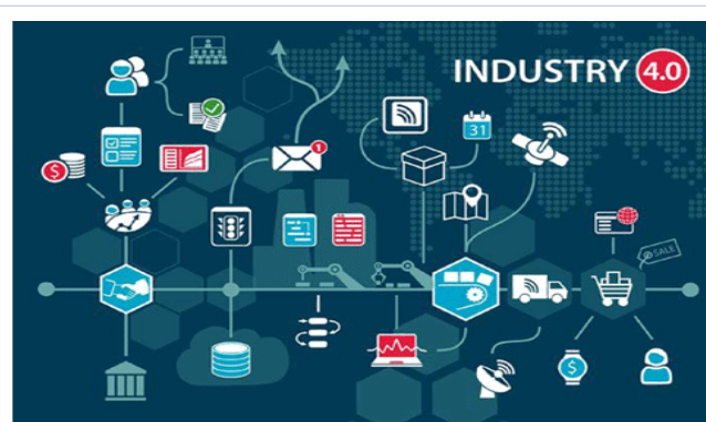
Figure 1: Smart Factory Schematic Diagram

Figure 1 illustrates the automated interaction between industries in the commercial process, where orders, bank payments, update notifications, fabrication, and product delivery are automatically orchestrated and monitored.