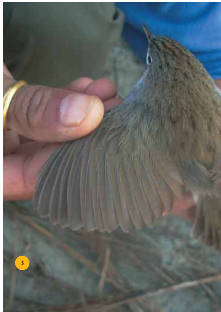
1 and 2. Different individuals of Prinia burnesii nipalensis showing lateral view. 3. Dorsal view showing wing details.