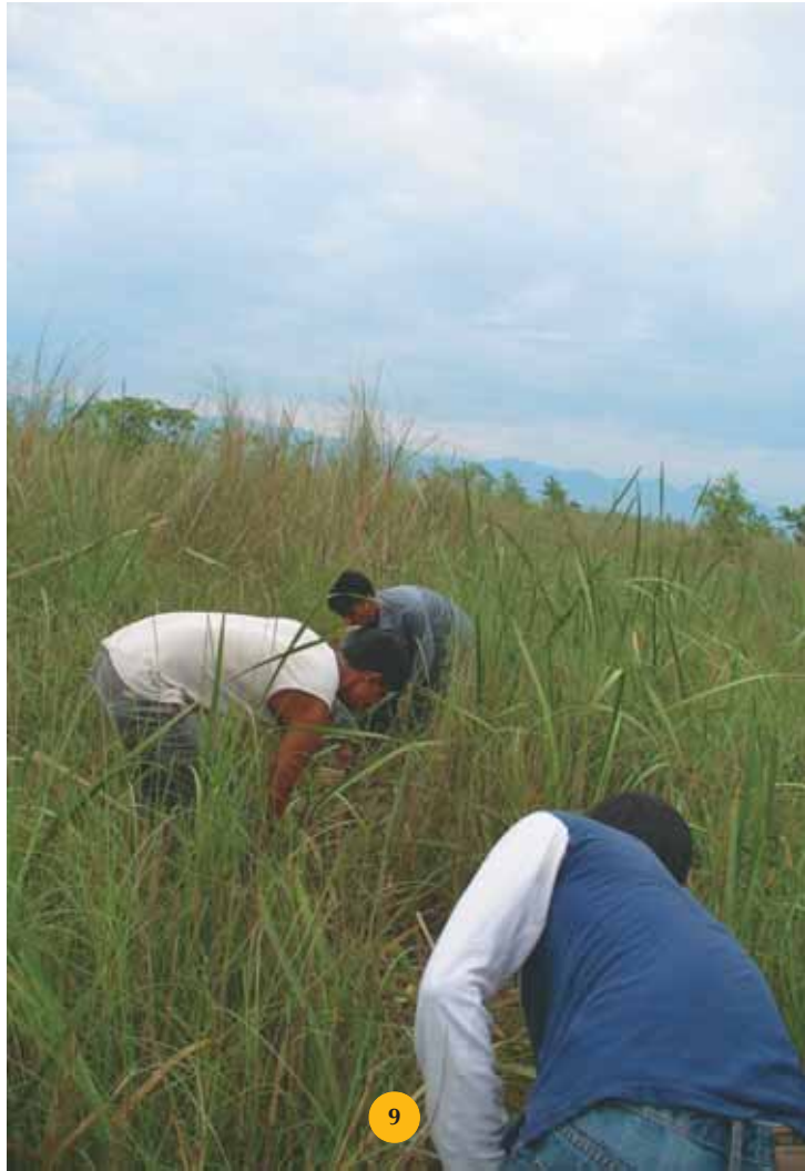
1, 2 and 3. Close up of lateral view, three different individuals. 4. Undertail coverts showing light rufous feathers. 5, 6, 7 and 8. Dorsal view, four different individuals. 9 and 10. Prinia burnesii nipalensis habitat.