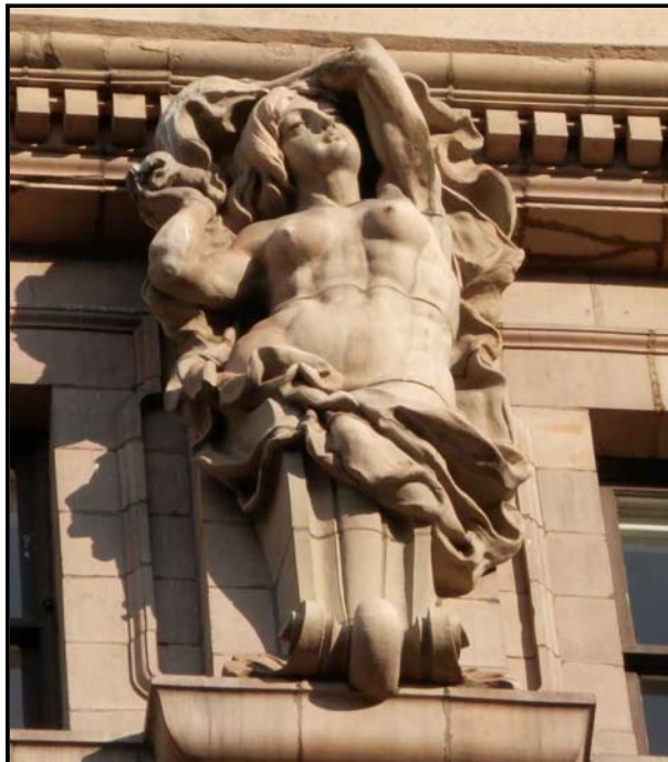
Decorations to the Sun Building - detail