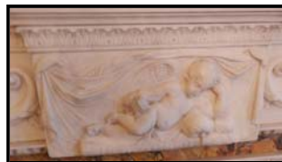
Detail - Hycroft Manor fireplace