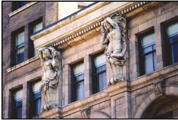
Decorations to the Sun Building