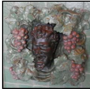
Detail - Hycroft Manor fountain