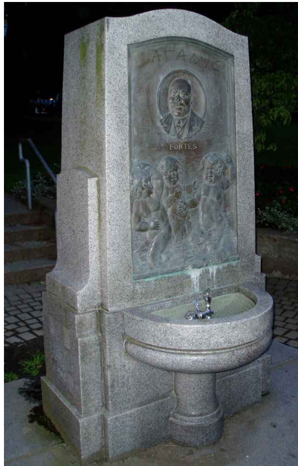
Joe Fortes Memorial