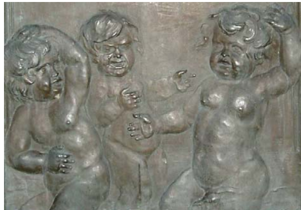
Detail, Joe Fortes Memorial