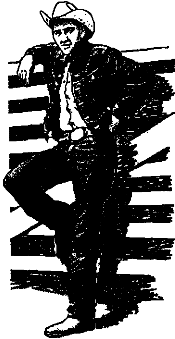
Figure 6-1. A little manure on the boots may disturb city folks, but in requirements work, you learn not to mistake appearance for value.