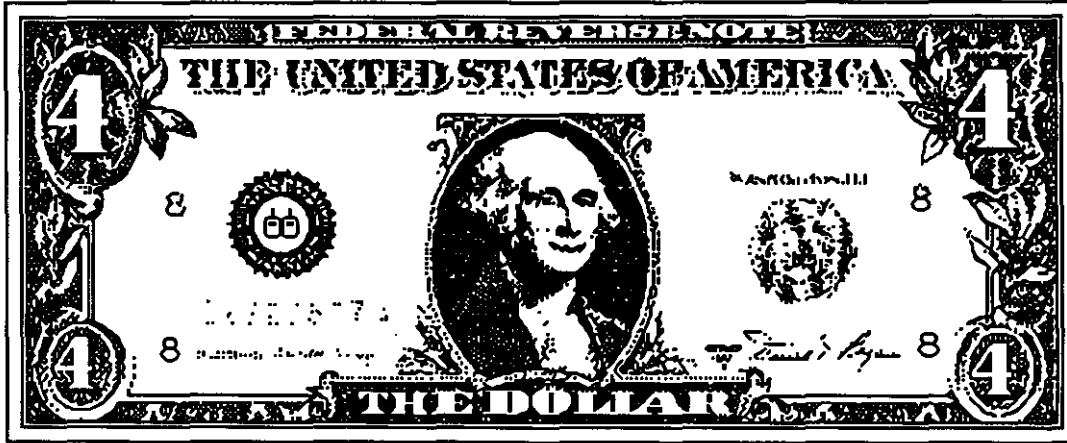
Figure 6-3. Context-free questions will help you avoid hearing this: “Oh, we thought you knew that. We always do it that way.”