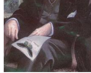
Alfred R. Wallace

Links to our Past News of the Present Insight for the Future