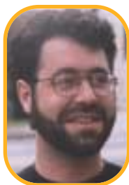
By Philip Crawford

Perhaps the most powerful way of encouraging children to read is by exposing them to light reading, a kind of reading that